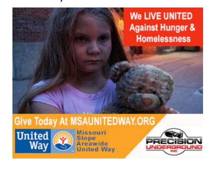
Sample online advertisement

» Minimum order of 100 LIVE UNITED T-shirts with your company's logo located on the shirt. (price range varies on quantity & T-shirt style)